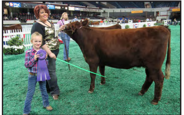
Division IV Champion: JF Crimson Jackson Farms