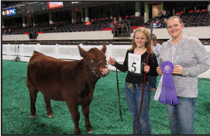
Division I Champion: JF Jessi's Girl Jackson Farms