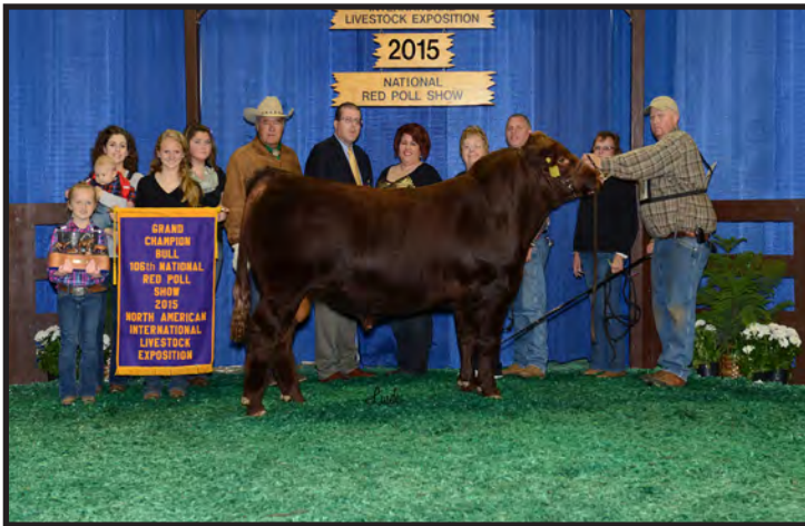
Grand Champion Bull: JF BJ Jackson Farms