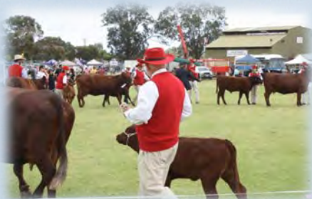
Cattle Show in Australia