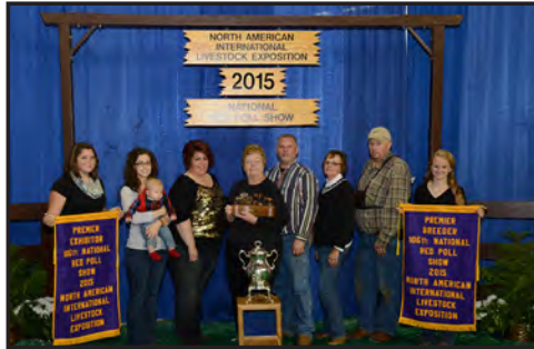
Premier Breeder: Jackson Farms