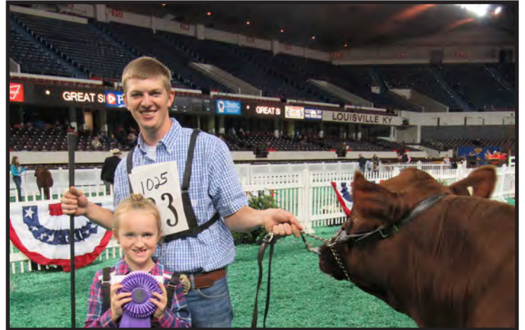
Division II Champion: Esquire's Rocket Esquire Land and Cattle Company