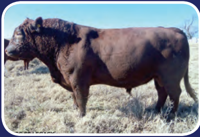
NWOC SS LEGACY shown here at four years of age and weighing 1800 lbs. We have been using Legacy successfully for 3 years. He has given us moderate size calves with good muscle expression. We will have sons and daughters from him for sale this summer.