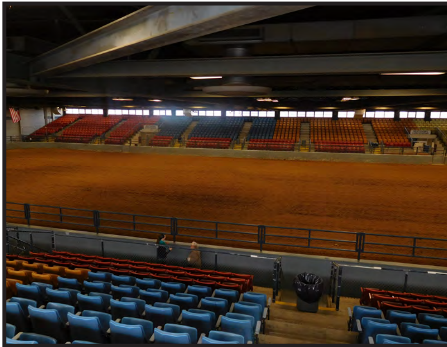
William Cherry Expo Center, Murray State University. Site of the 2016 National Red Poll Sale.

10) Share! Share ideas that work for you with other breeders and especially new breeders