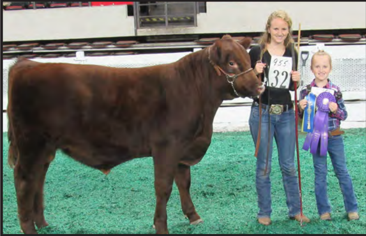
Division I Champion: JF Boomerang Jackson Farms