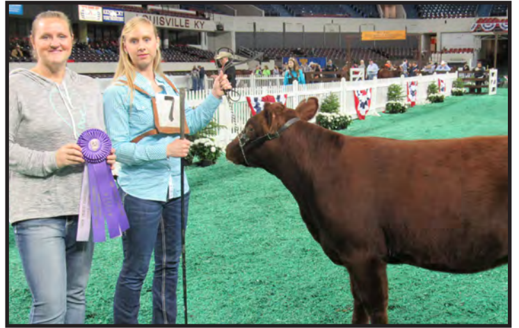
Division II Champion: AK's Atta Girl AK Cattle Company