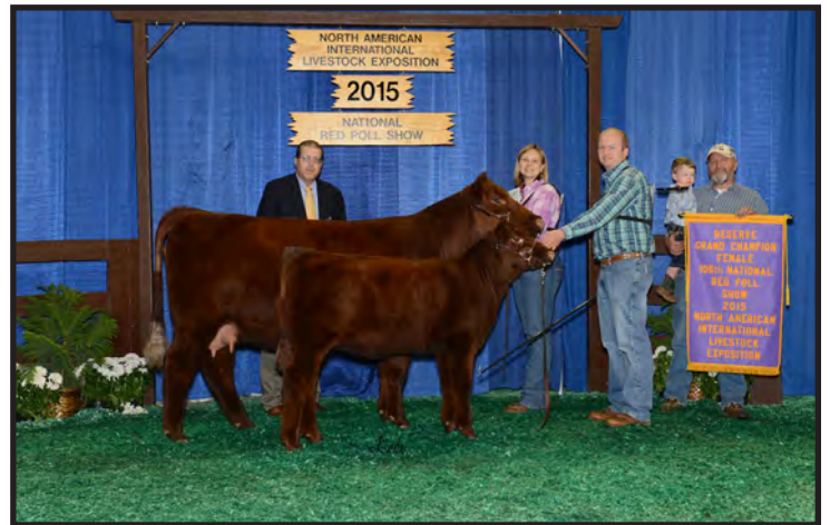
Reserve Grand Champion Female: DRM Shamrock Suzy Q, McCall Show Cattle