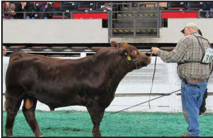
Division III Champion: JF BJ Jackson Farms