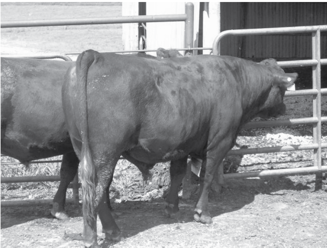
Grass - raised Red Poll bulls at the Western States Field Day.