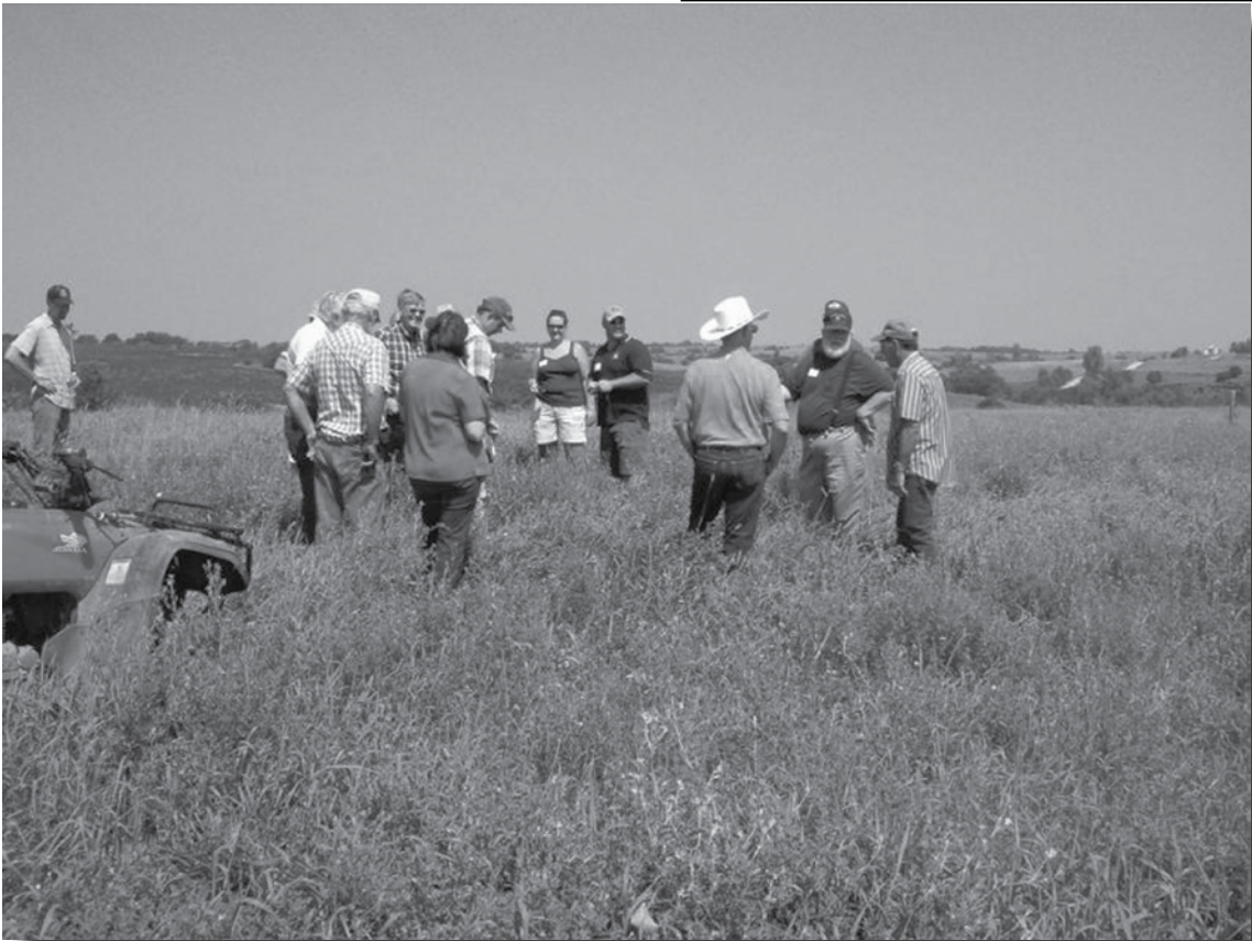
The Western States Red Poll Family talk pasture at Lueken's Rolling Prairie Ranch