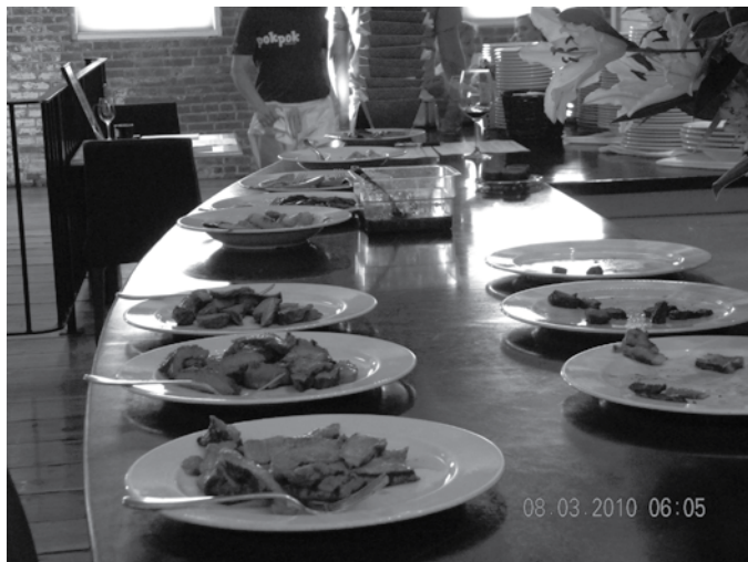
The Professional Presentation

As a tagline of advertisements, health warnings, environmental damnations, public land debates, personal gluttony, and national pride, finding clarity within the cattle ranching at times resembles the