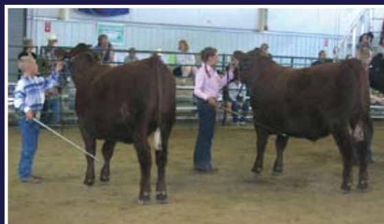
Our grandchildren at the Routt County Fair in Colorado

Outstanding proven sire. Exceptionally sound feet & legs. Outstanding capacity and overall conformation. 35.4 cm scrotal at 13 months with ideal shape and suspension. Sire carcass registered. Generations of proven carcass merit. 1/2 sibs were showing winners. CSS Semen qualified for shipment to Europe and New Zealand.