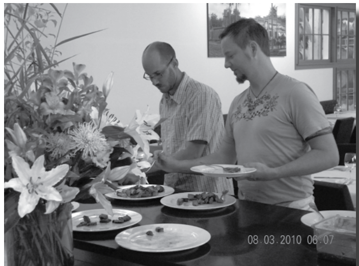
The Chefs Tasting