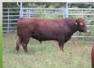
PAPEON Outfitter Bulls