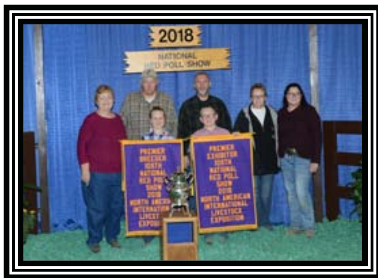
Premier Exhibitor & Premier Breeder Jackson Farms