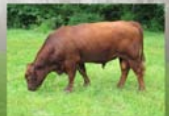
WARRIOR Gentalman Jack Bulls