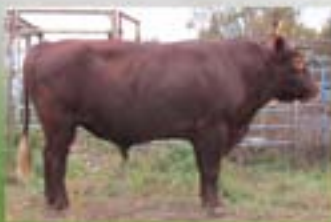
DEXTER Munday Bulls