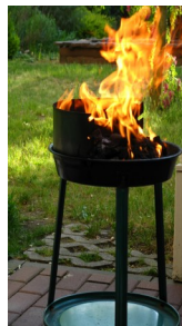
TABLE TOP GRILL, TOOTH SPEAKER