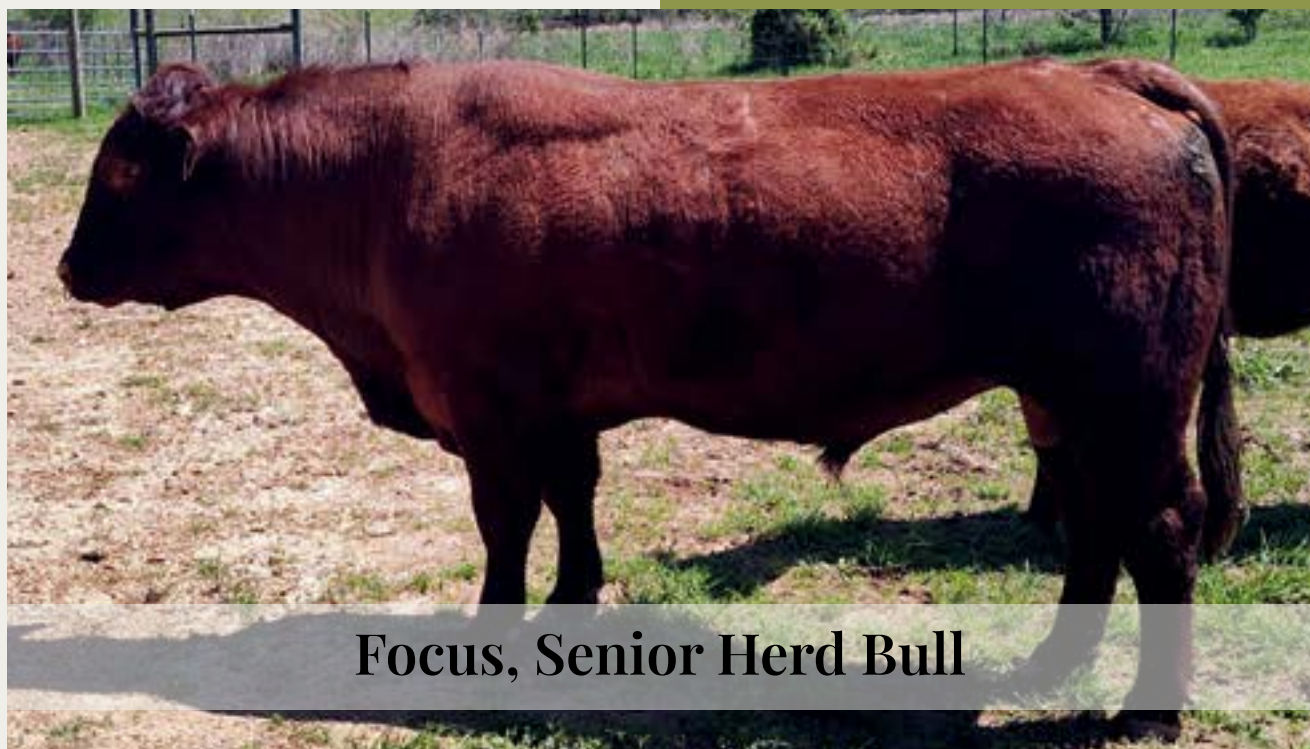
Focus, Senior Herd Bull