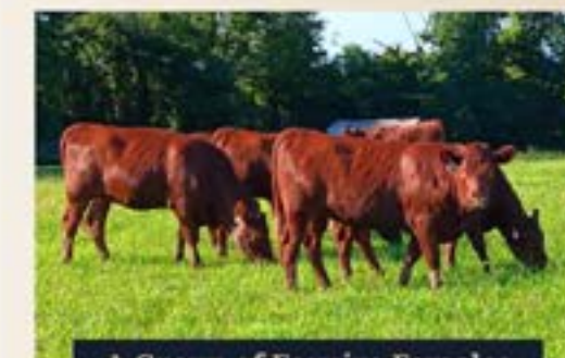
A Group of Esquire Females