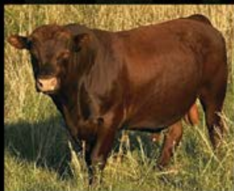
Lost Creek Heifers

Cow/Calf Operation | Custom Beef Business