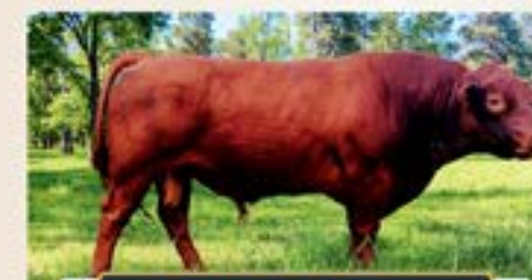
Esquire's Eclipse 2019 National Grand Champion