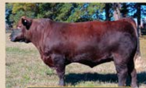
Esquire's Top Flight 2023 National Grand Champion