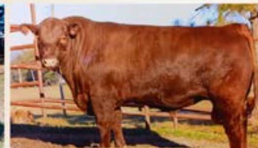
Esquire's Navigator 2009 National Grand Champion