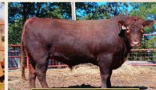
Esquire's Justified 2023 National Senior Champion

Esquire's Navigator has sired 3 National Grand Champion Bulls & 2 Reserve Champion Bulls