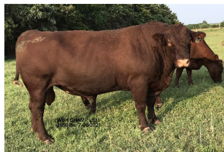
Our Herd Sire