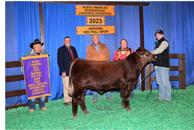
Grand Champion Bull ESQUIRE TOP FLIGHT ESQUIRE ECLIPSE X ESQUIRE SILVER CHIP SHOWN BY ESQUIRE LAND AND CATTLE