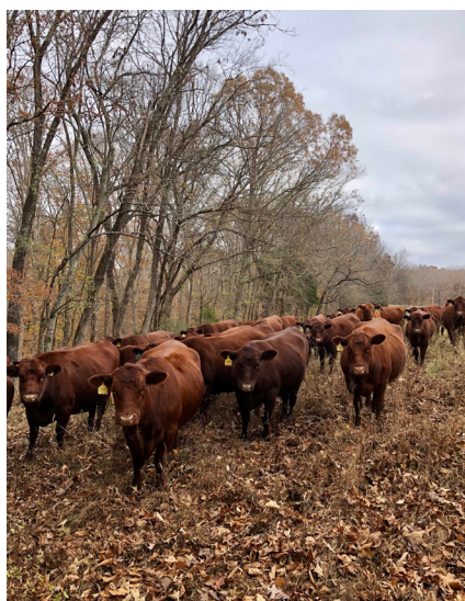
Red Poll Journal Designed by: