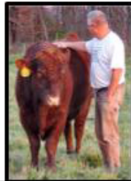
Announcing our Jr. Herd Bull, GLS Mabel's 303. Sire: Carl's 303 Boy Dam: Shuter's Mabel

A Family Farm Established in 1954 -4 Generations paving the path for the future-